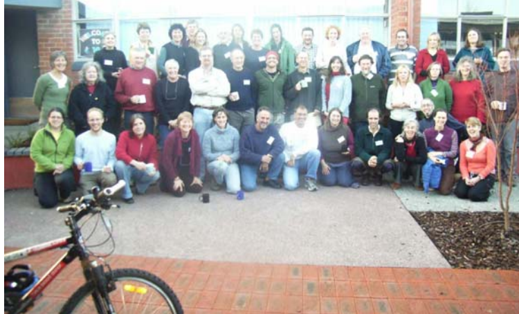
The Transition Initiatives participants June 2009, at Friends School where the training weekend was held.

Sustainable Living Tasmania organised a Transition Initiatives weekend workshop in Hobart June 27-28 which was attended by 40 community activists from around the state, with an equal number of people who are on a 'waiting list'. We perceive a substantial community desire for collaborative, transformational action. We are now developing a website, planning additional workshops and support activities.